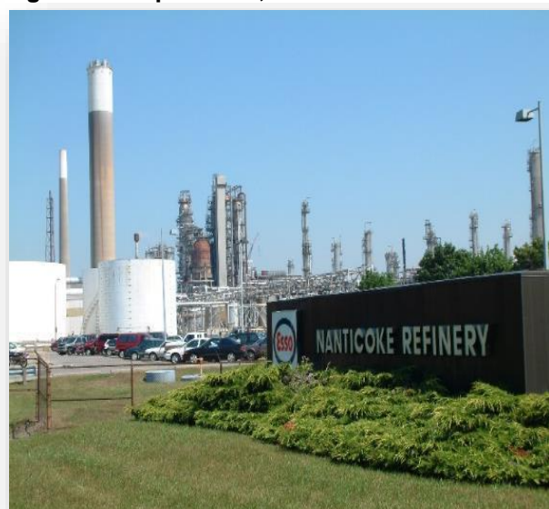
Figure 15: Imperial Oil, Nanticoke